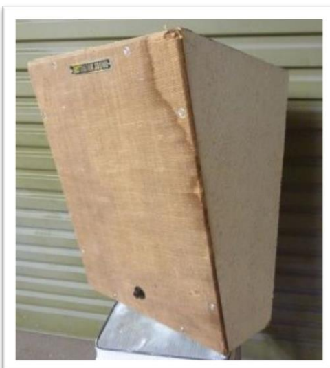
Australian Sound VIC 1960's