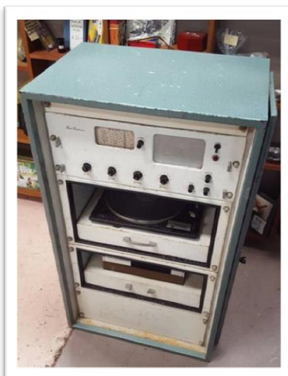
Flett Electronics NSW 1960's

Companies around Australia were tasked with making these systems. Bland Radio in South Australia, Australian Sound in Victoria, Crammond Radio in Queensland and Audio Engineers (was Flett Electronics) in New South Wales. Bland and Australian Sound built their systems from scratch. Crammond Radio built their radios using Philips Amplifiers and generic cabinets for their systems. Audio Engineers Pty Ltd in the 1950's were also contracted to install Hospital Radio systems but seemed to disappear in the 1960's, which bought Flett Electronics in as the major contractor.