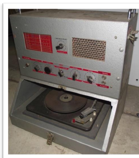
Audio Engineers NSW 1950's