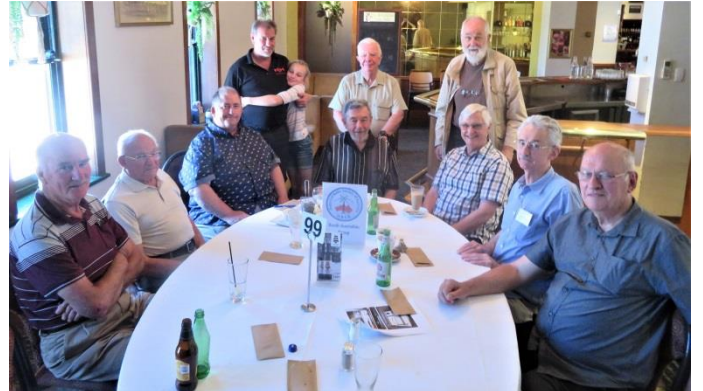
ABOVE LEFT: November Retirees Luncheon