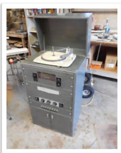
Crammond Radio QLD 1960's

Being at school in the 70's and 80's, the change in priority of technologies was very noticeable. At Junior Primary in the mid 70's we had assembly daily, with the national anthem at the start and mid- afternoon and there would be "let's Have Music" on the classroom speaker. By grade 7 it was a weekly assembly with the occasional radio broadcast and TV program in the Schools media room. We were watching programs such as "Against the Wind" which was produced as a program for the Public, and a Historical Drama for schools. These programs were either live or on the new U-matic tapes. By High School, the assemblies were still required and each classroom had a Belling Lee socket on the wall for Televisions that were trolleyed to the classroom and program fed from a central room.