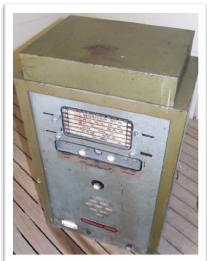
Australian Sound VIC 1960's