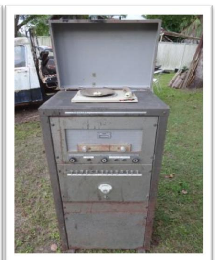
Philips QLD 1960's